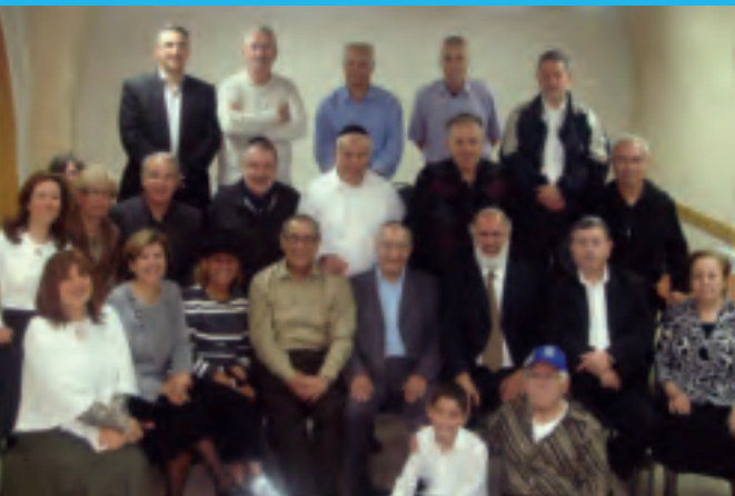
Montreal Federation Mission is a trip of adults who come to Israel to visit and do volunteer work in their sister city of Beer Sheva. A highlight of their trip is a shabbat at the SEC.