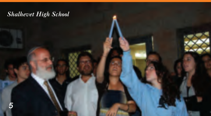
Shalhevet High School