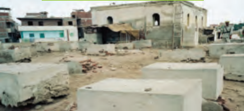
Shrine of Rabbi Ya'akov Abuhatzaira in Damanhur, Egypt